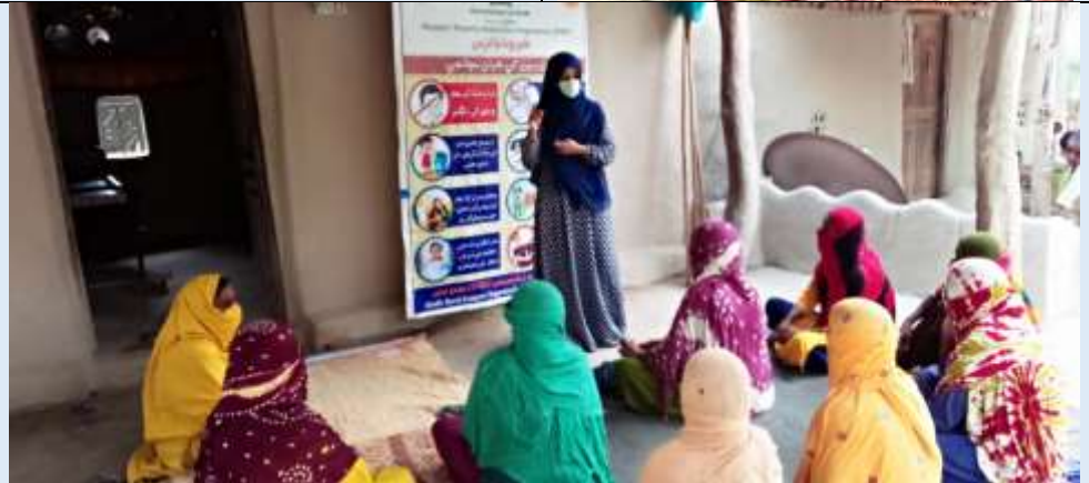
COVID-19 Awareness sessions at District Mirpurkhas