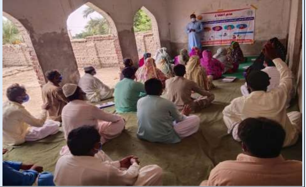
Community based COVID-19 Sessions at District Shikarpur