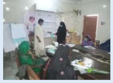
CRPs Training on COVID-19 at District Shikarpur