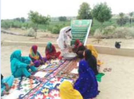
Hand-washing activity at District Khairpur